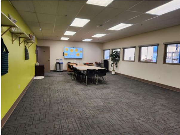
Added a programming space