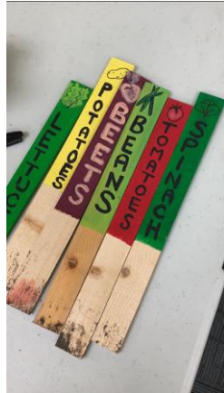
Gardening in Small Spaces including creating garden stakes