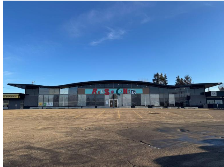
Increased accessibility and parking