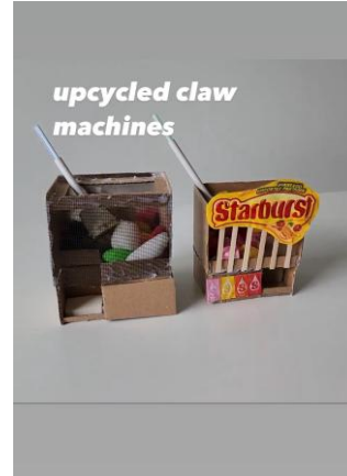
Upcycled Claw Machine