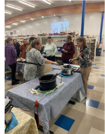
Beeswax Food Wraps