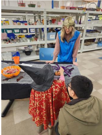
Trick or Treating featuring education and jar lanterns