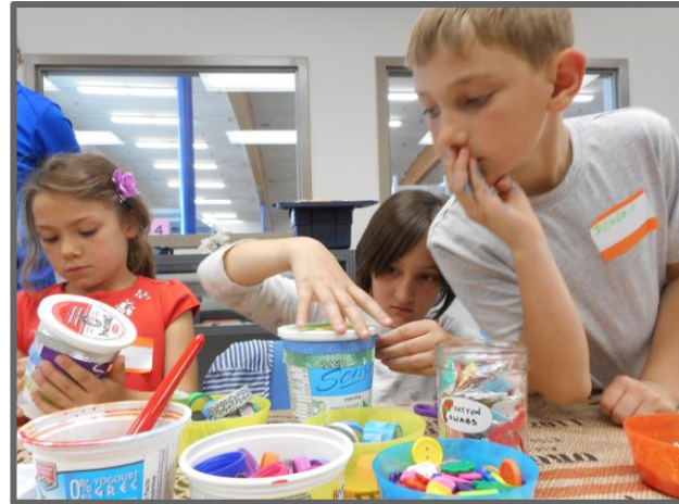
Began booking educational programs and birthday parties