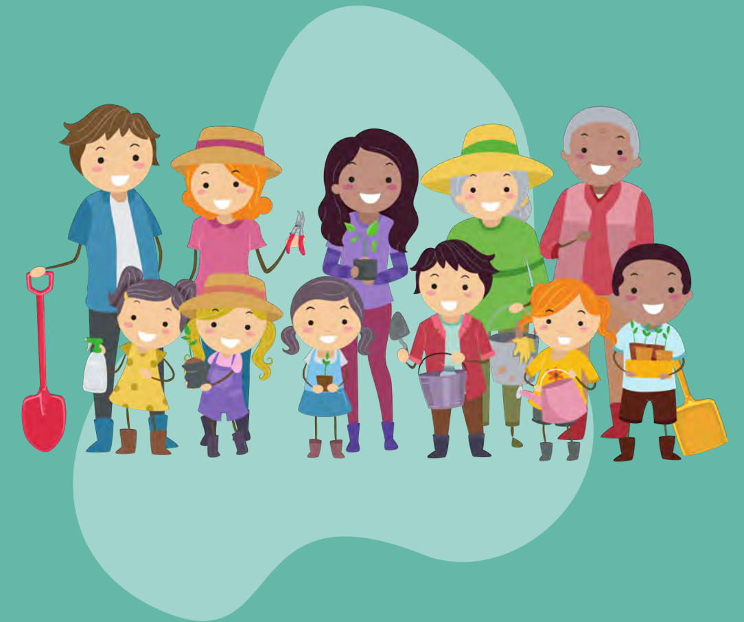
Groups & Organizations