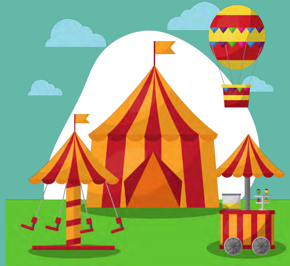
Festivals and Parades